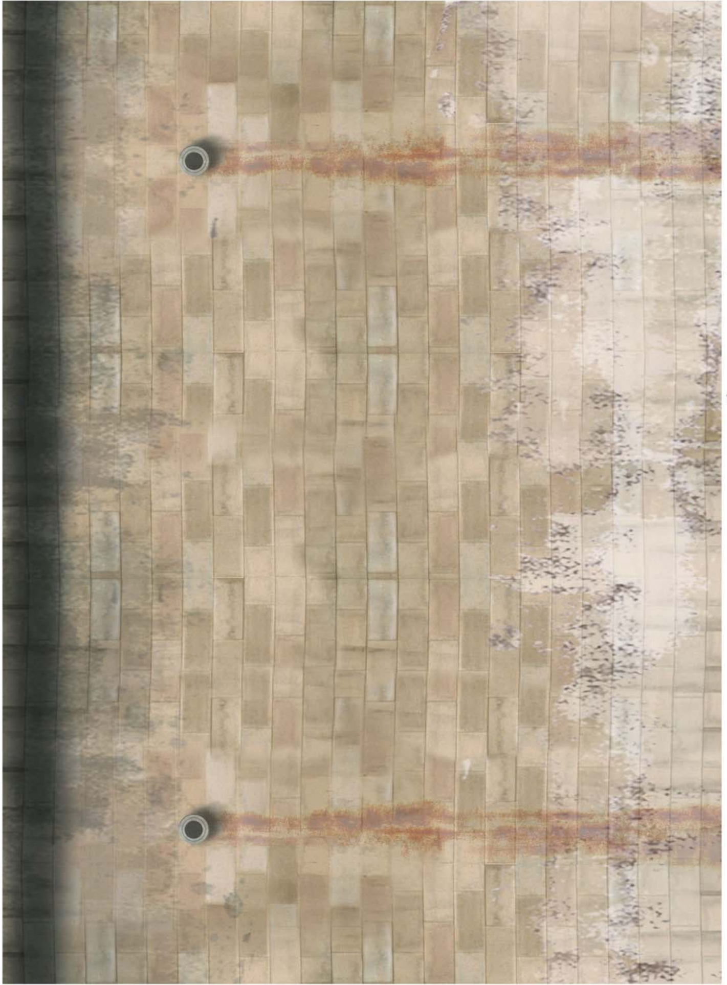
Three-Story City Wall (print out two per wall section)